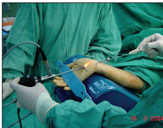
Fig. 2: Photograph showing endoscope placement in the exit portal and the retrograde (hook) knife placed through the proximal portal to release the transverse carpal ligament.