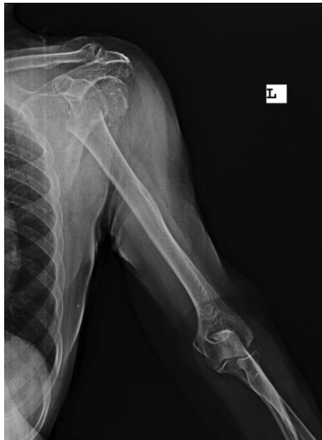
Fig. 1: Radiographic image of the humeral head fractures and dislocation.