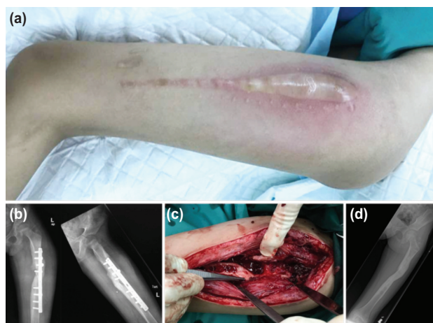
Fig. 2: (a) A long surgical scar with a swollen and erythematous left thigh from osteomyelitis of the femur. (b) Radiograph showing osteomyelitis of the left femur and plate loosening. The fracture had united, (c) Intraoperative photograph after debridement and removal of plate. The femur (at the tip of the forceps) had united. (d) Radiograph one year after injury showing fracture remodelling and resolution of infection.

An 8-year old girl had sustained closed fractures of the left femur and ipsilateral clavicle following a motor-vehicle accident. She had undergone open reduction and plating of the left femur, while the clavicle fracture had been treated