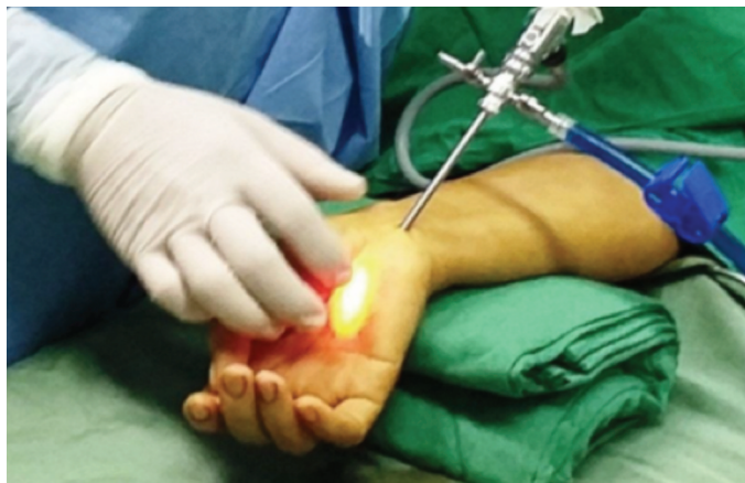
Fig. 1: Determination of the second incision.