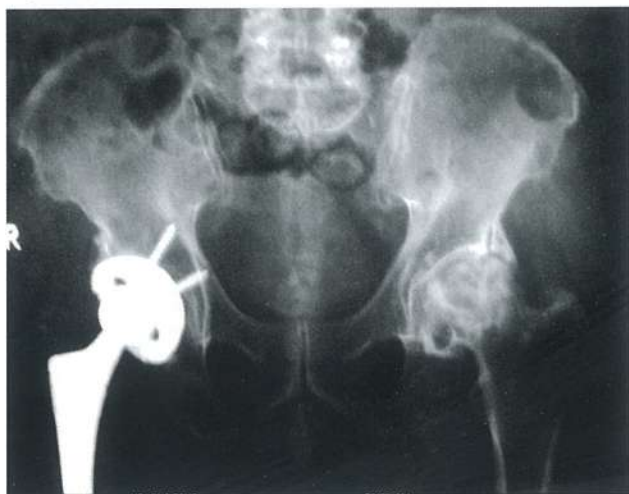
Figure 12. Case 4. Right total hip replacement with a co-existing left Ficat stage III AVN.

Physical examination revealed a right hip scar of the previous THR but there was swelling and erythema in that area. Range of motion was normal. In view of a previous hip replacement, he was diagnosed with septic arthritis and subsequently arthrotomy and wound irrigation was done. Post-op management included IV saline, Cefazolin and Gentamicin.