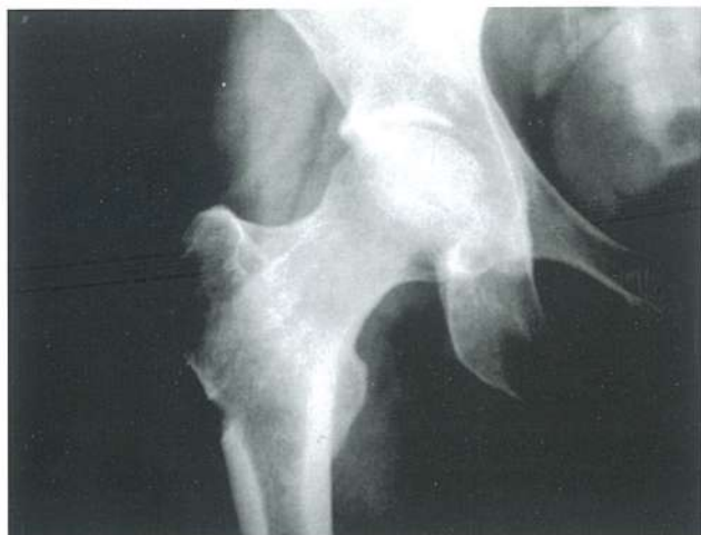
Figure 4. Case 1. Right core decompression without bone graft.

femoral avascular necrosis, he was also educated on the possibility of having a left total hip replacement in the near future.