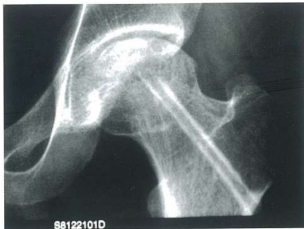
Figure 8. Case 2. Core decompression with fibular allograft inserted into the core track.

Upon regular follow-up, his symptom of pain improved and there was a gradual improvement in his range of motion. More significantly, there was also been a sequential improvement of the disease based on the radiological features seen on sequential X-rays taken post-op. He is currently still on follow up with CGH and has resumed his NS duties.