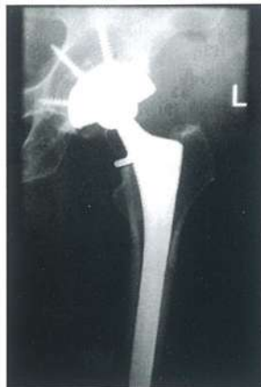
Figure 13. Case 4. A left total hip replacement.

Management: NLS underwent another elective left total hip replacement (Figure 13) and post-op therapy showed that he had recovered full ambulatory status. He was subsequently discharged with analgesic and antibiotic medication. Currently, he is still on follow up.