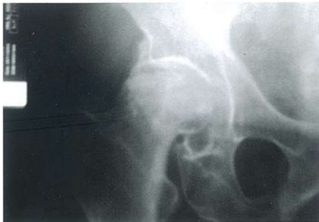
Figure 11. Case 4. AVN of right femoral head.