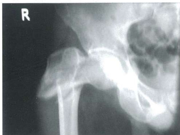
Figure 5. Case 1. Subtrochanteric fracture of left femur.

One month later, he slipped and fell on his buttocks while walking on crutches at home. He then experienced right hip pain and was unable to ambulate thereafter. Radiological findings showed a right subtrochanteric fracture (Figure 5), and open reduction and internal fixation was performed.