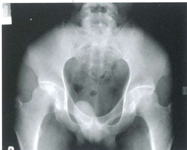
Figure 7. Case 2. Right Ficat stage II AVN.

and confirmed the diagnosis of avascular necrosis of the left femoral head as evidenced by decreased signal density in the antero-superior aspect of the femoral head. X-ray was repeated and now showed evidence of subchondral cyst formation, making it a stage II disease (Figure 7)