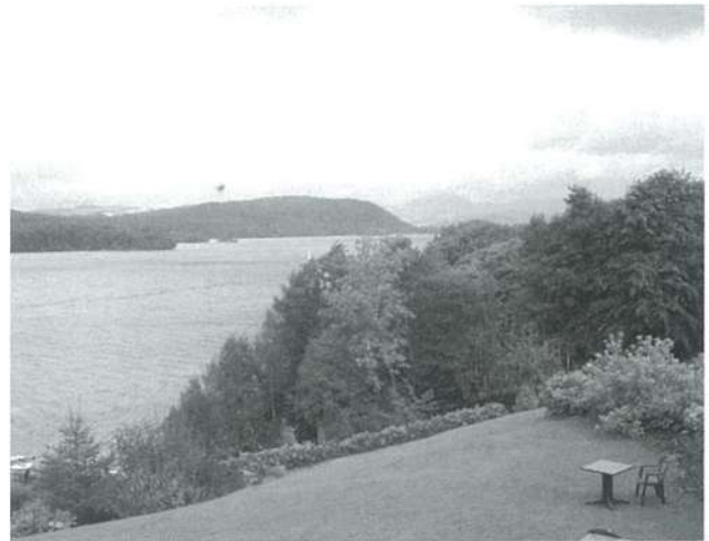
The Lake District