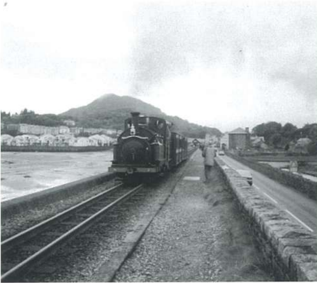
Steam-engine train in Porthmadog, North Wales