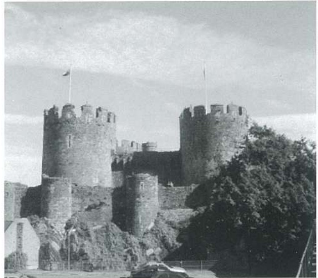
The 13 th century Conwy Castle in North Wales