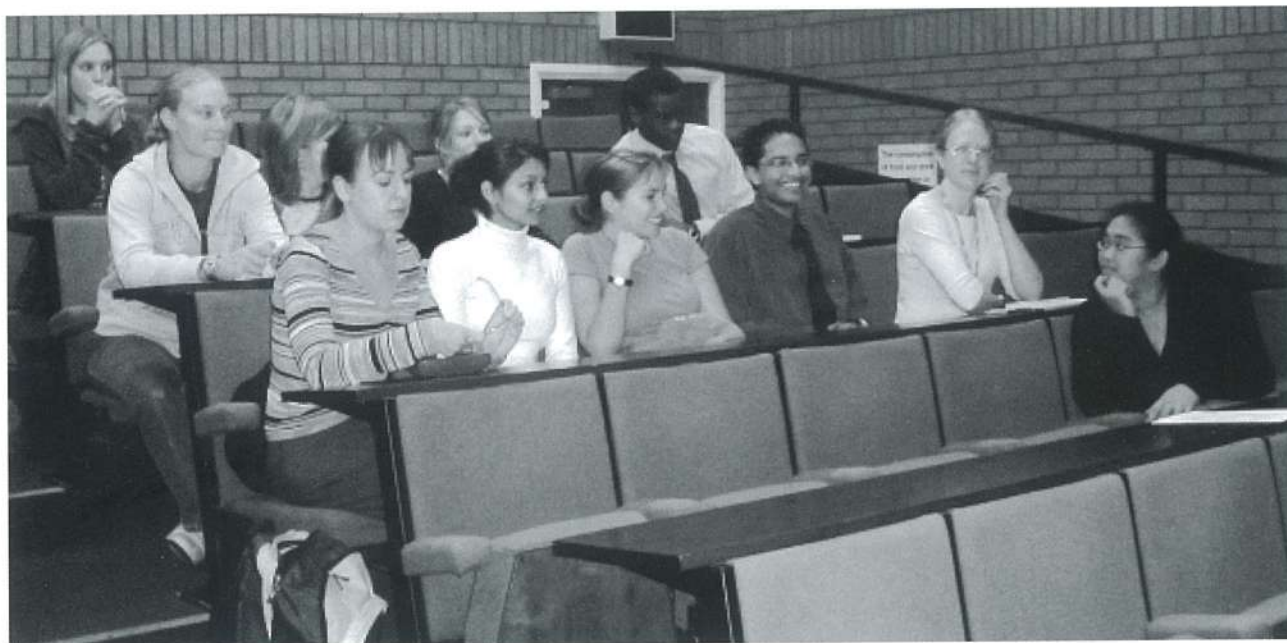
Fourth year medical students from the University of Birmingham attending our session

We felt that the traveling fellowship had achieved its aims namely to foster closer links between the Asean Orthopaedic Association and the British Orthopaedic Association. A traveling fellowship is different from a clinical or research fellowship. We were all mid-career consultants and the opportunity to meet and network with our colleagues in the United Kingdom was invaluable. We've enjoyed attending and participating in the BOA congress in Manchester, listening to and giving lectures in the various hospitals and attending the operating sessions. The weekend visits to the Lake District and Snowdonia National Park were delightful. We stayed at family-run B & Bs during the weekends and had a wonderful time with our hosts. The five of us got on well with each other and we certainly hope that this inaugural Asean-BOA fellowship will continue indefinitely just as the junior, senior and the Asean-AOA traveling fellowships. Last but not least, we would like to thank the Asean and British Orthopaedic Associations, our UK hosts and our families and colleagues for their support.