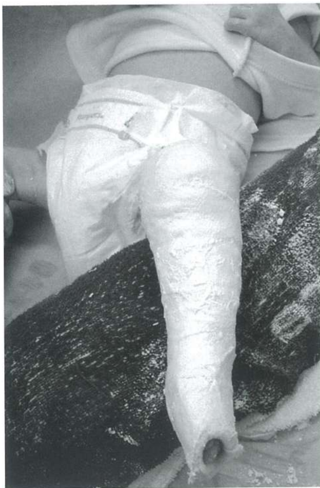
The Ponseti clubfoot clinic in Booth Hall Children's Hospital, Manchester