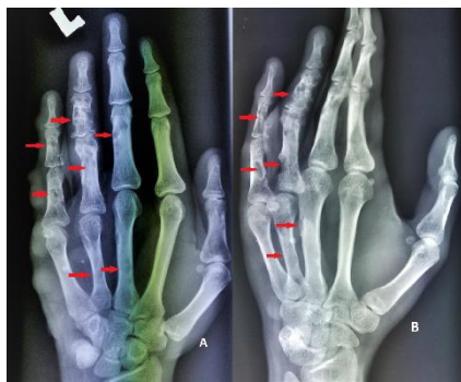
Figure 2: multiple well define bony lesions. (red arrow)