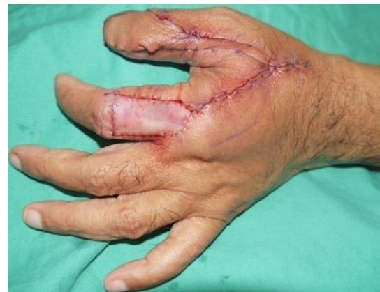
Figure 2; Soft tissue reconstruction using the 1 st dorsal metacarpal artery island flap and full thickness skin graft from left inner arm.