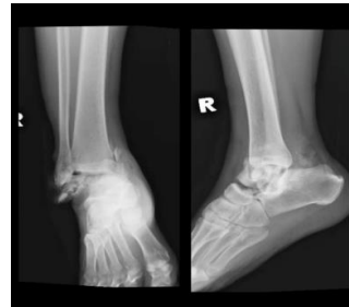
Figure 1: Post trauma x-ray

Later on, the patient showed tremendous amount of healing both clinically and radiographically (figure 2). The patient able to walk independently at 5-month post operation with well healed wound